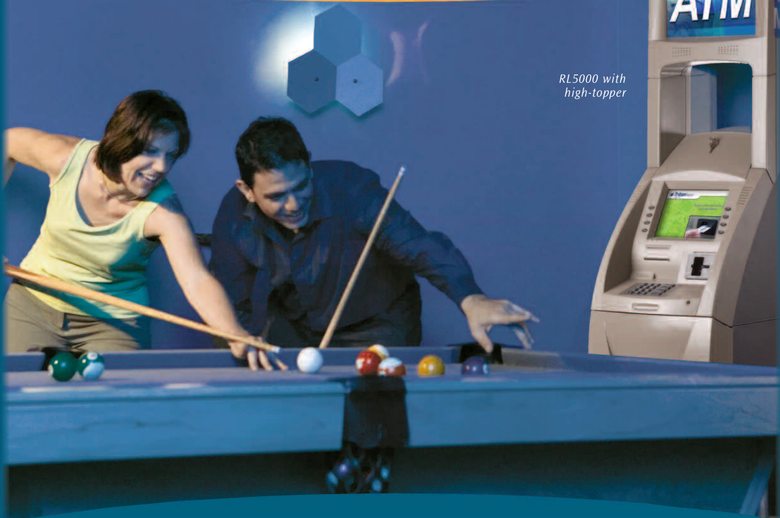
RL5000 with high-topper